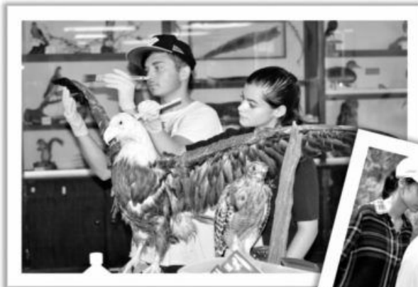
Photo: Summer high school volunteers cleaning animal specimens.