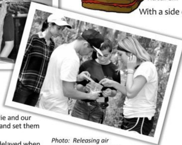
Photo: Releasing air potato beetles to control this invasive exotic plant.

single personal philosophies in life. The first is live well. The second, do right. Both are accommodated with every single visit I make to TLNC. I feel privileged to be a part of Trout Lake Nature Center.